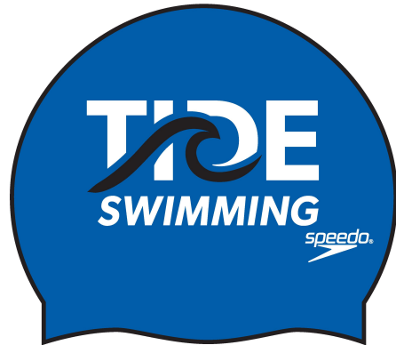
TIDE Blue Caps Silicone $13 Latex $5.00