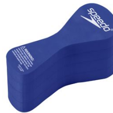
Pullbuoy Team $10.00 Blue / Black / Lime