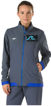
TIDE Warm-Up Jacket $65 / Youth $55 Pant $35 / Youth $30