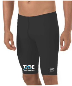
TIDE Jammer W/ LOGO Team Price: $45.00