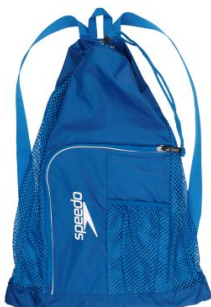
Deluxe Mesh Bag $16.00 Color based on availability