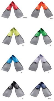
Trialon Fins Team $27.00 Color by size