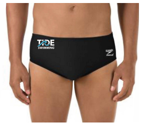
TIDE Brief W/ LOGO Team Price: $37.00