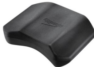
Pull-Kick $12.00 Black