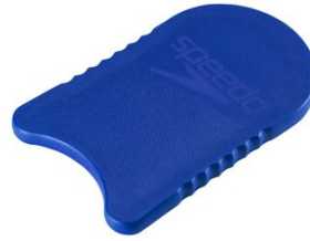
Kickboard $15.00 Black or Blue