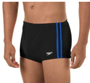
Drag Suit $29.00 Black/Blue