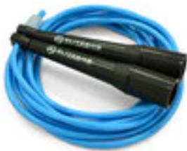
Jump Rope Team $12.00 Color based on availability