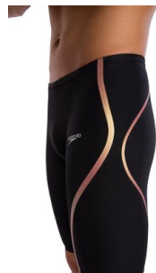
Fastskin LZR Pure Intent Team Price: $290 Regular or High Waist