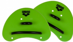
Fingertip Paddles Team $16.00 Color based on availability