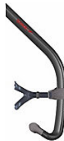
Snorkel $27.00 Charcoal / Lime / White