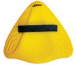
Alignment Kickboard $16.00 Yellow