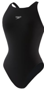
LZR Pro Recordbreaker Team Price: $160