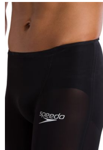
Fastskin LZR Pure Valor Team Price: $250 Regular or High Waist