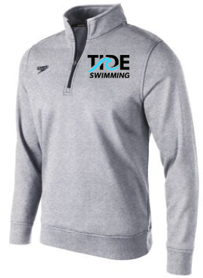
NEW TIDE 1/4 Zip Sweatshirt $55