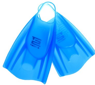
Tech 2 Fins Team $62.00 Color based on availability