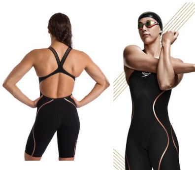
Fastskin LZR Pure Intent Team Price: $425 Open Back