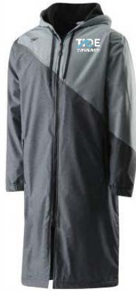
TIDE Parka $125 Black or Blue