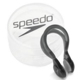
Nose Clip $5.50 Color based on availability