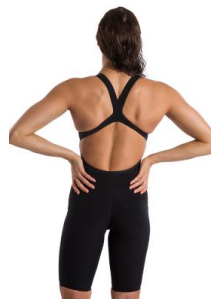
Fastskin LZR Pure Valor Team Price: $350 Open Back