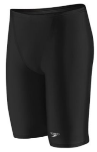
LZR Pro Jammer Team Price: $135