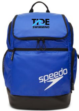
TIDE Backpack $65 Multiple Color Choices