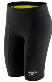
Vanquisher Jammer Team Price: $80 (Add $5 for Print Design)